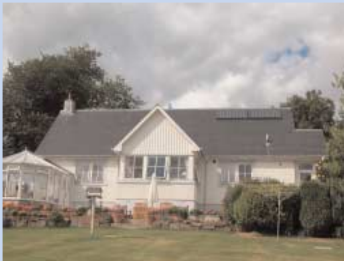
Fig 1: Solar water heating system installed in a Perthshire home.