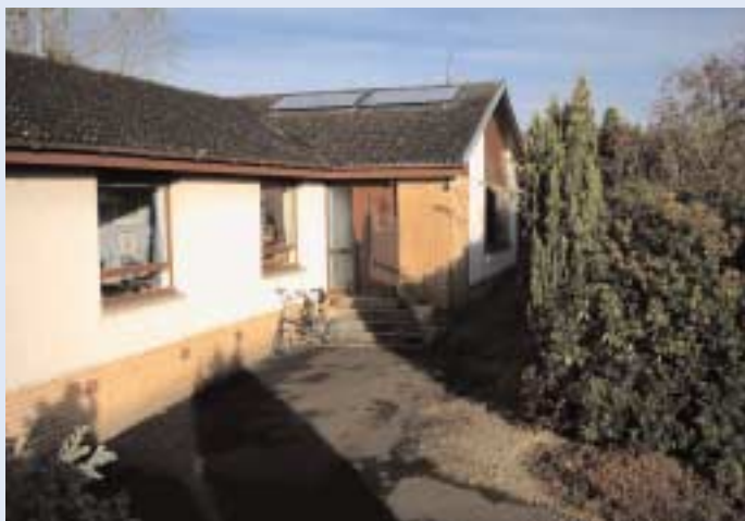
Fig 3: Flat plate collector system installed in a Glasgow home.

Costs vary due to a range of factors such as size of collector, type of roof, existing hot water system and geographic location. The typical installation costs for flat plate collectors is £2,000 - £3,000 while evacuated tube systems will cost £3,500 - £5,000.